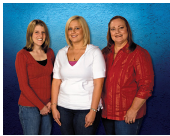
EPD Accounting and Human Resources