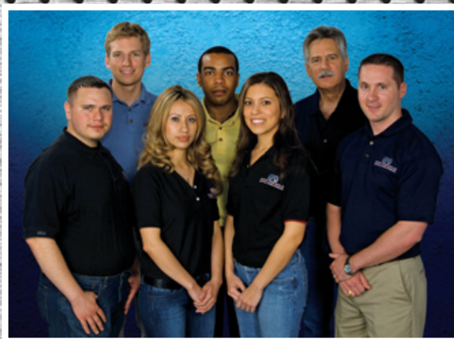
EPD Marketing and Administration